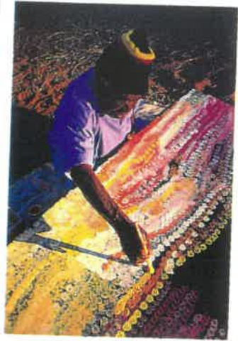
WORK IN PROGRESS Kngwarreye's 'dump-dump' style breaks all the conventions of central desert art. She works the canvas with brisk, determined jabs and rapidly covers large areas with soft-edged blotches of colour – 'Her works just sing'.