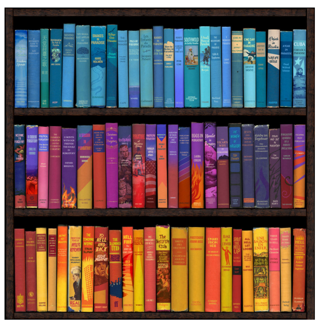
Phil Shaw, The Divine Comedy, 2022, Eight colour pigment based archival print on Hahnemuhle paper, 90 x 90 cm

Two years ago, the Rebecca Hossack Art Gallery curated an exhibition – Inferno – of contemporary works inspired by the first section of Dante's epic poem. It was one of several acclaimed shows mounted across Europe and the USA to celebrate the seven hundredth anniversary of Dante's death.