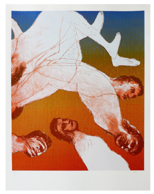
Sidney Nolan, Inferno VI, 1967, screenprint, 102 x 69 cm

An exhibition of works inspired by the life and writings of Dante Alighieri.