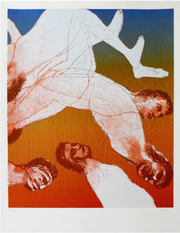
Sidney Nolan, Inferno VI , 1967, screenprint, 102 x 69 cm

An exhibition of works inspired by the life and writings of Dante Alighieri.