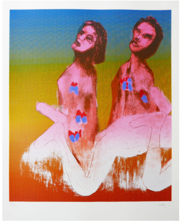
Sidney Nolan, Inferno VII , 1967, screenprint, 102 x 69 cm

Few writers have had such a profound influence upon Western visual culture as Dante Alighieri. His great poem, The Divine Comedy (as it is now known), has inspired artists almost since the time of its completion in 1320: from Giovanni di Paolo and Sandro Botticelli, through William Blake and Dante Gabriel Rossetti, to Robert Rauschenberg and Sidney Nolan. And it continues to inspire artists to this day.